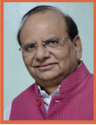
विनय कुमार सक्सेना उपराज्यपाल Vinai Kumar Saxena Lt. Governor